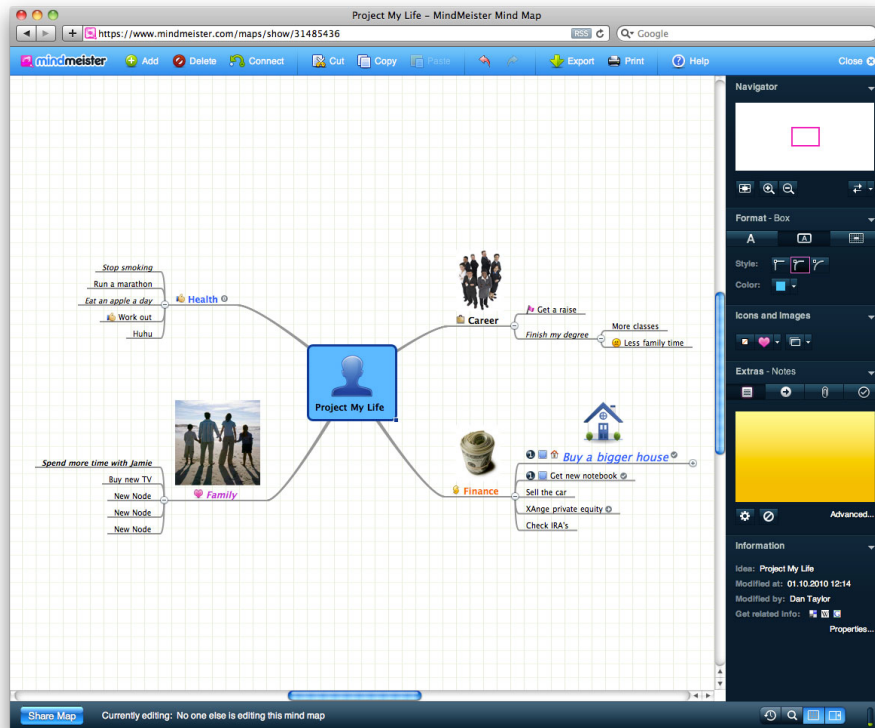
Figure 3: screenshot of MindMeister distributed on the company's press page 10

Mindmeister 11 excels at mind-mapping in the browser, and even provides live collaboration with multiple users. Users can create public, rich mindmaps like the one shown in Figure 2 well-suited to sharing of ideas. However, it is a single-function website and does not allow other types of content, and is not ideal for collaboration as many people are still unfamiliar with the concept of mindmaps. It also has limited free functionality and setting up a large sharing system would involve paid subscription by members or an organization. It is also endemic to mindmaps that their contents are not crawlable by search engines, impairing discoverability by uninitiated users and the public.