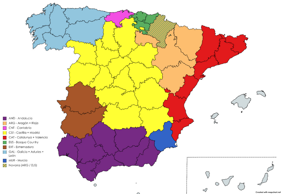
Figure 1: Area covered by each label (Created with https://www.mapchart.net )

Looking at the variation of the musical traditions explored in section 2.1.2, it was concluded that for the purposes of this project, Spain would be split into 9 distinct regions, as seen in figure 1.